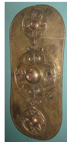
Battersea Shield, 1st century BCE, currently housed in the British Museum